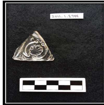
(Figure 2. Harriet D Munnick Collection Glass Fragments)

The digitized historic materials collected and stored in PastPerfect are available for anyone to research online. The SPMHS' website provides guides and research links for aspiring genealogists and veteran researchers alike (Figure 3). The "Genealogy" tab on the main page of the website offers general information on genealogy and local information including: Early French Canadian settlers, the History of St. Paul, Friends and Family of French Prairie, Catholic Church Records, and the St. Paul Cemetery.